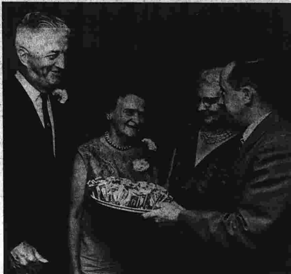
To Remind You of Connecticut

HARTFORD 15, CONNECTICUT Telephone 249-1611